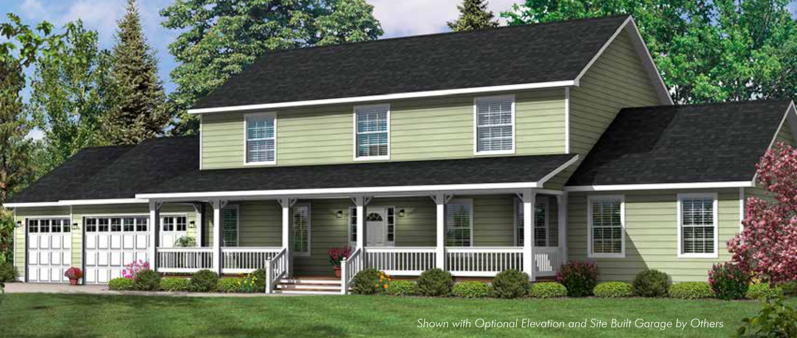
Shown with Optional Elevation and Site Built Garage by Others

26'8" x 60' | 4 bed-3.5 bath | 2842 sq.ft.