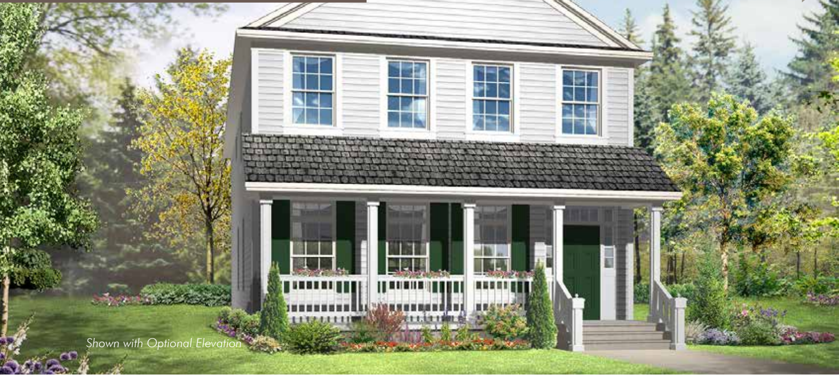
Shown with Optional Elevation

40' x 30' | 3 bed-2.5 bath | 2520 sq.ft.