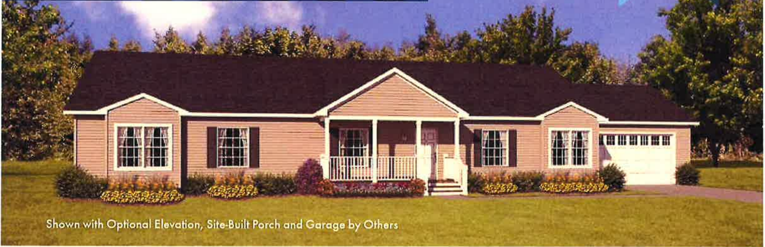
Shown with Optional Elevation, Site-Built Porch and Garage by Others