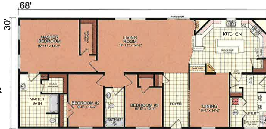
Bi-fold doors and window in utility room standard on Modular only

OPTIONAL ARMOIRE and/or ENTERTAINMENT CENTER & BOOKSHELVES