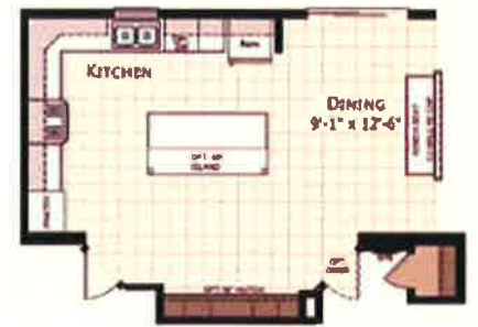
OPTIONAL BOOTH SEAT