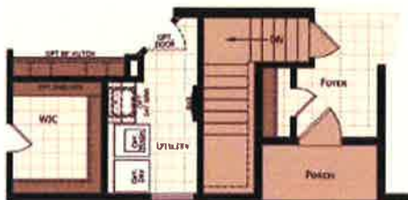
OPTIONAL STAIRWELL Available on Modular only