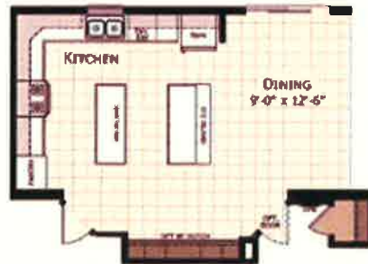
OPTIONAL DOUBLE ISLAND