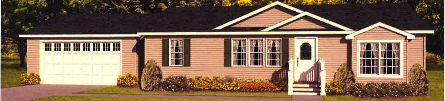
Shown with Optional Elevation, Site-built Garage by Others