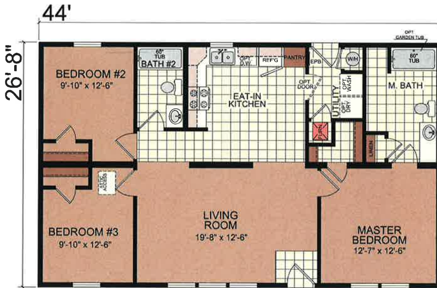
3 windows/2 windows standard on Modular only