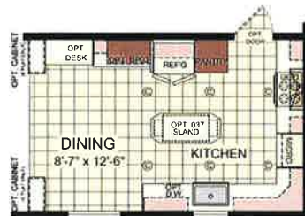
OPTIONAL ULTIMATE KITCHEN 2