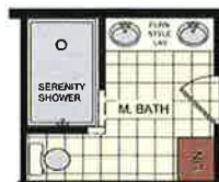
OPTIONAL SERENITY BATH