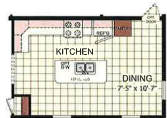
OPTIONAL KITCHEN 3