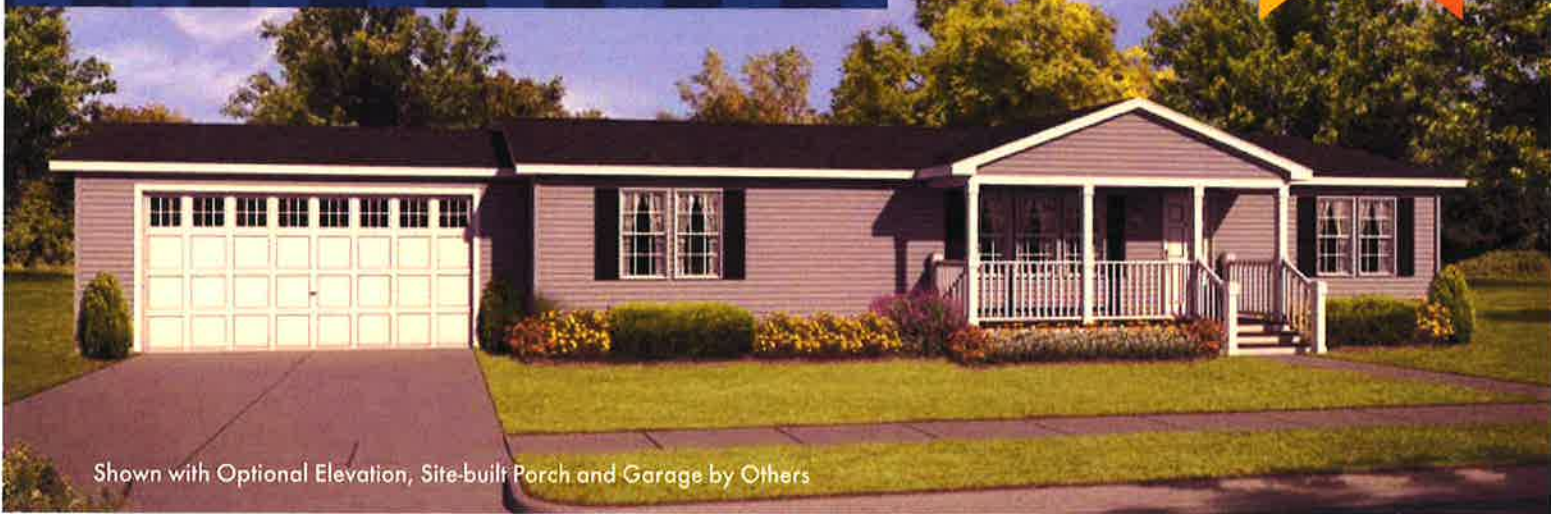
Shown with Optional Elevation, Site-built Porch and Garage by Others