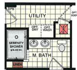
OPTIONAL SERENITY SHOWER