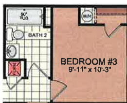
Furnace and water heater locations for Multi-Section only