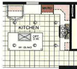
OPTIONAL ULTIMATE KITCHEN 2